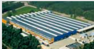
Hörmann Genk NV, Belgium