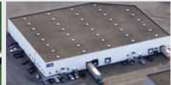
Hörmann Flexon, Leetsdale PA, USA

Hörmann is the only manufacturer worldwide that offers you a complete range of all major building products from one source. We manufacture in highly-specialised factories using the latest production technologies. The close-meshed network of sales and service companies throughout Europe, and activities in the USA and China, make Hörmann your strong partner for first-class building products, offering "Quality without Compromise".