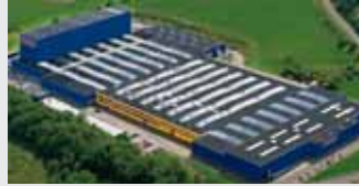
Hörmann KG Freisen, Germany