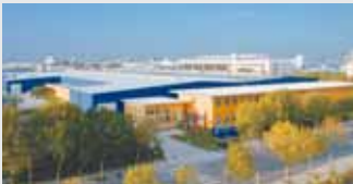
Hörmann Beijing, China