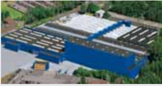
Hörmann KG Amshausen, Germany