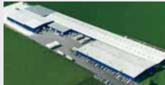
Hörmann LLC, Montgomery IL, USA