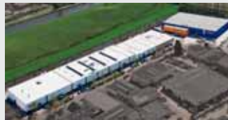
Hörmann Alkmaar B.V., Netherlands