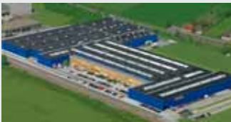
Hörmann KG Werne, Germany