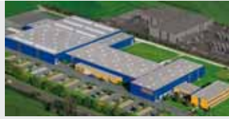
Hörmann KG Antriebstechnik, Germany