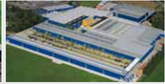
Hörmann KG Brockhagen, Germany