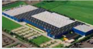
Hörmann KG Brandis, Germany