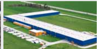
Hörmann Legnica Sp. z o.o., Poland