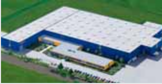
Hörmann KG Dissen, Germany