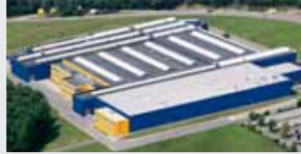
Hörmann KG Eckelhausen, Germany