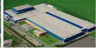
Hörmann KG Ichttershausen, Germany