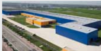
Hörmann Tianjin, China